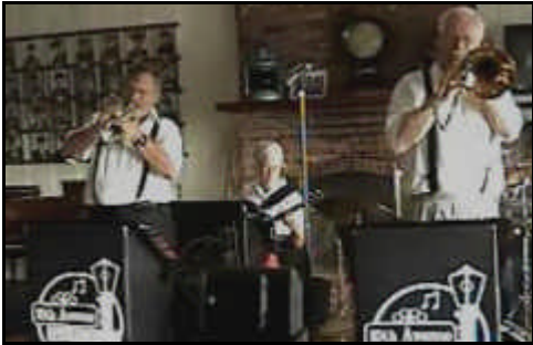
The 10 th Avenue Band really swings!