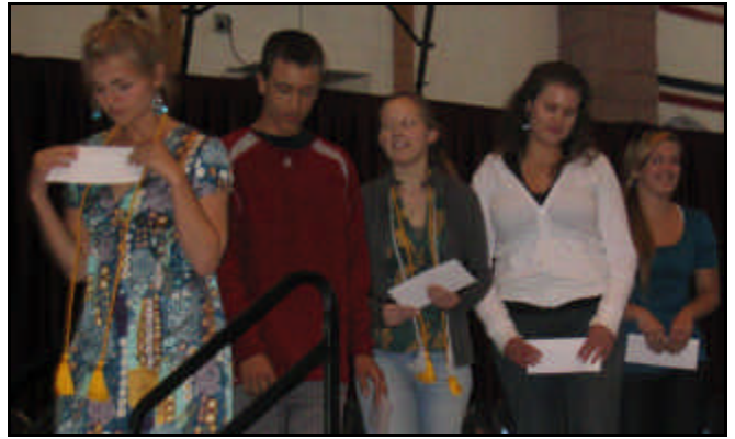
Anzar scholarship recipients

Aromas Live! continues to be a big hit. This fun, biannual Aromas Community Grange variety show brings in new talent from our community, giving them a place to share their enthusiasm and make new artistic connections. The show is free, and it comes around on the last Saturday in April and October at 7 pm. Be sure to get it on your calendars now!