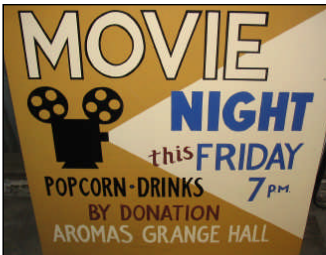
Watch for Grange Movie Night signs – call 726-2349 for info