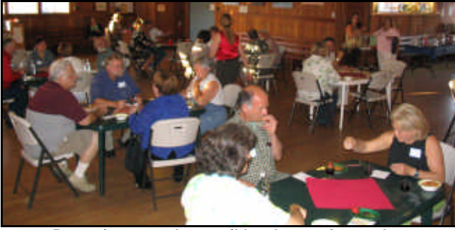
Bunco is easy to learn, wild and crazy, fun to play

2008 Year-End Newsletter www.aromasgrange.org