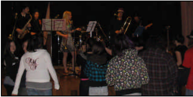
Los Destacados and Fans